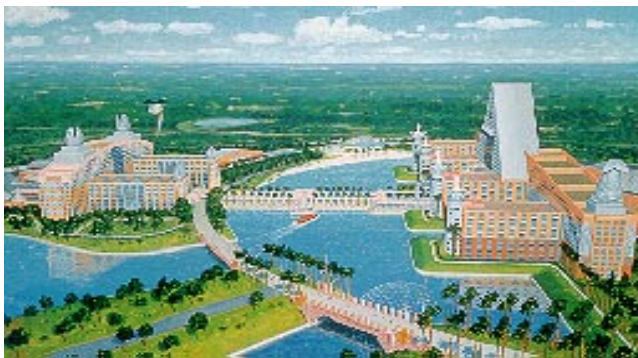
Walt Disney World's Swan and Dolphin Hotels will be the exciting location of STC's 47th Annual Conference next May.