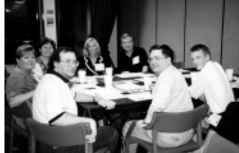
Players in the Dilbert ethics game