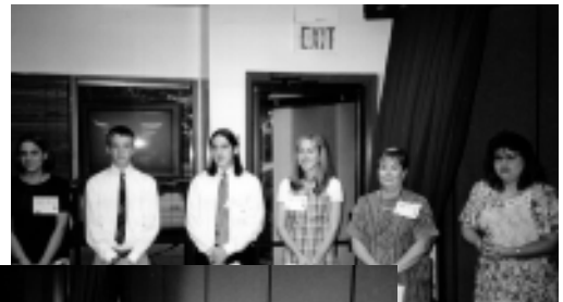
The winners of the High School Technical Writing Competition and their teachers (above)