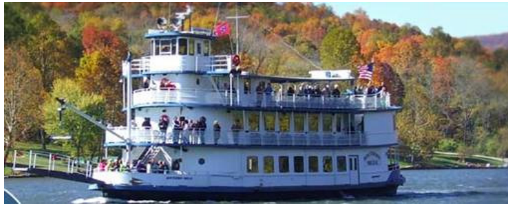
Southern Belle Riverboat

The Practical Conference on Communication is on track to cover our expenses, so the conference planners want to give regional STC chapter members an insider price break. To that end, the conference planners want to extend a 35% discount to STC members who register for PCOC. That's more than $100 off the regular price and makes your registration investment less than $195 for the full conference! For a 2-day, multi-session conference, that's an incredible bargain.