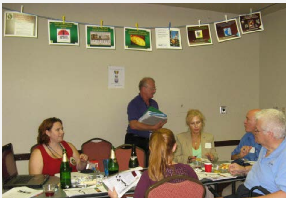
Festooned with the traditional washlines and colorful signs, the WPCC meeting room metamorphasized into Central California for the evening.