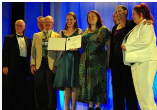
Receiving our chapter's Community of the Year Award on-stage at the Honors Banquet